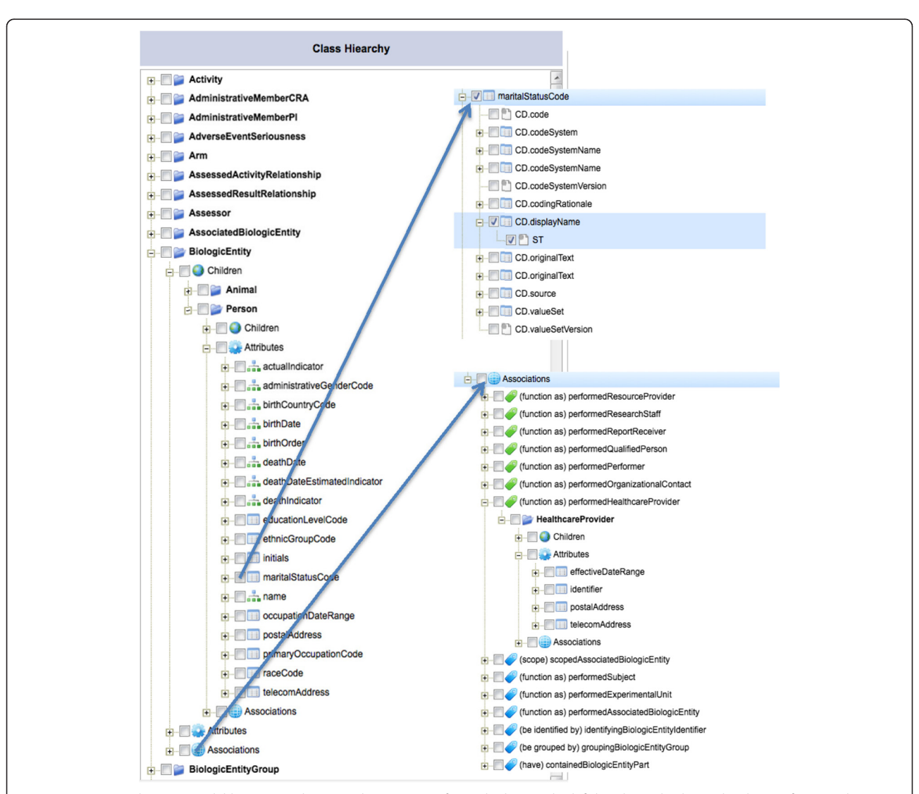
Fig. 4 A customized BRIDG model browser with a metadata structure for each class. In the left hand panel, a hierarchical tree of BRIDG classes is displayed. In the right upper part, it displays nested sub-components and their selection for the data type (i.e., CD) of an attribute Person.maritalStatusCode. In the right lower part, it displays the associations of the class Person